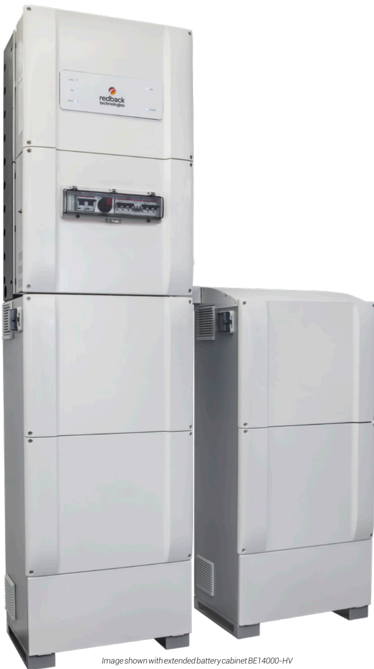
Image shown with extended battery cabinet BE14000-HV

The system combines a 10kVA solar inverter with two standard battery storage capacity options of either 9.6 or 14.2kWh and an option for an extended capacity of 19.2 or 28.4kWh. The Smart 3-Phase Hybrid System also includes a pre-wired BoS and integrated isolators to ensure a fast and easy installation.