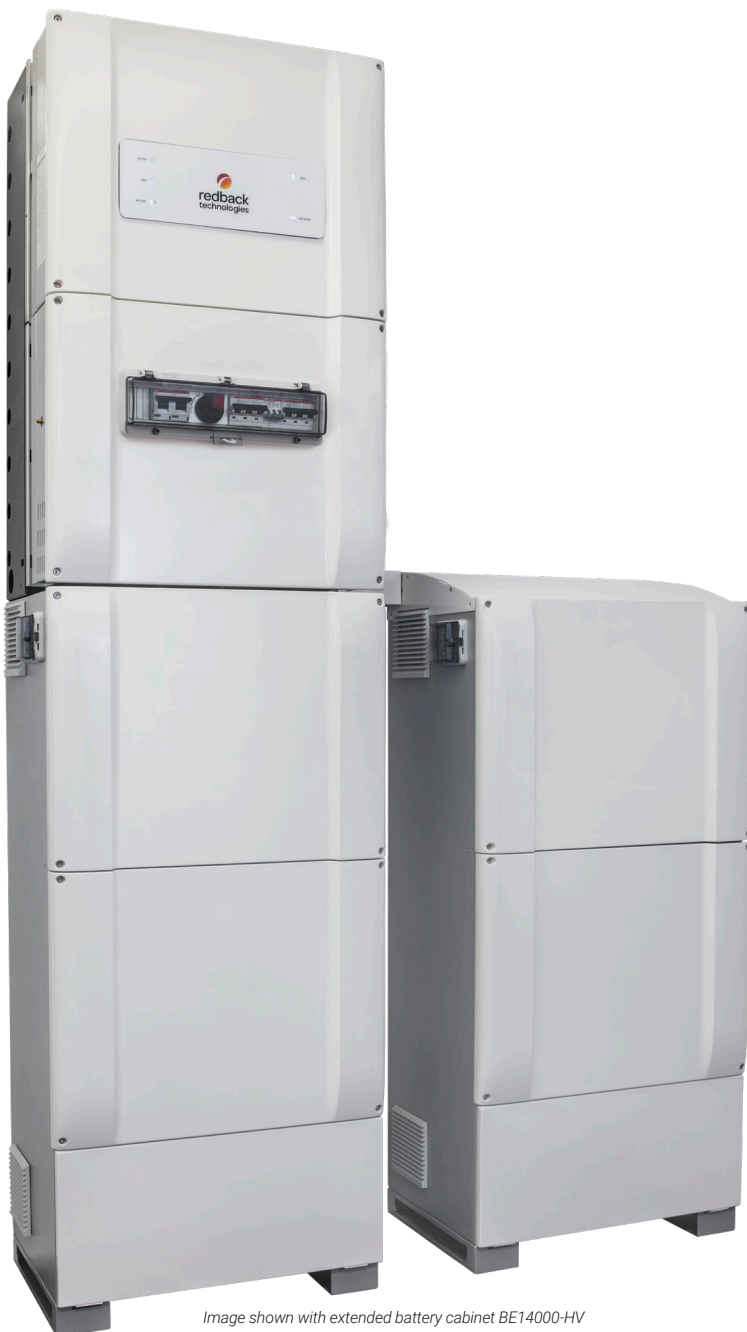
Image shown with extended battery cabinet BE14000-HV

The system combines a 10kVA solar inverter with two standard battery storage capacity options of either 9.6 or 14.2kWh and an option for an extended capacity of 19.2 or 28.4kWh. The Smart 3-Phase Hybrid System also includes a pre-wired BoS and integrated isolators to ensure a fast and easy installation.